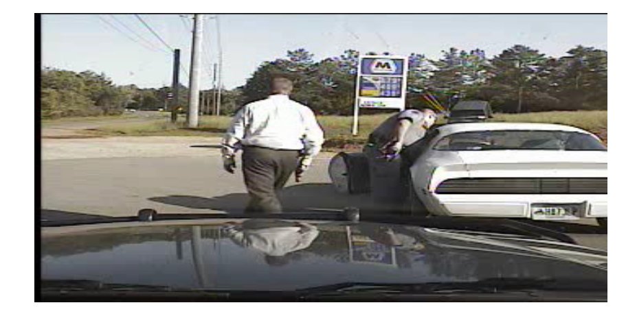
Exhibit "G" (Brown Dashcam) at 18:11:57.